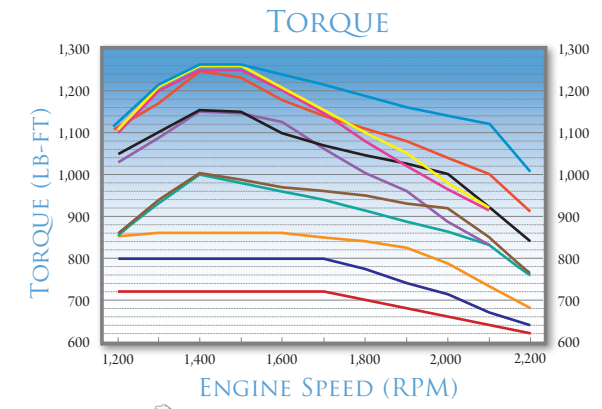
ENGINE SPEED (RPM)